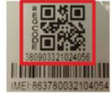
Watch ID - QR code example.